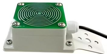
Installation and fixation