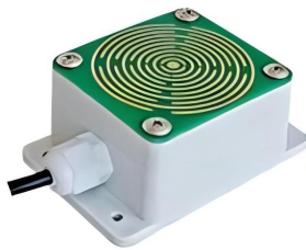
Rain and Snow Sensor